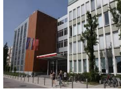
Faculty of Health Sciences