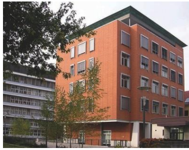
Faculty of Pharmacy