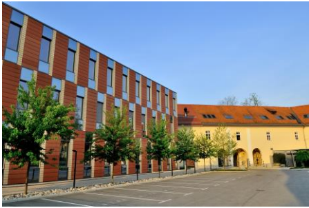
Faculty of Medicine